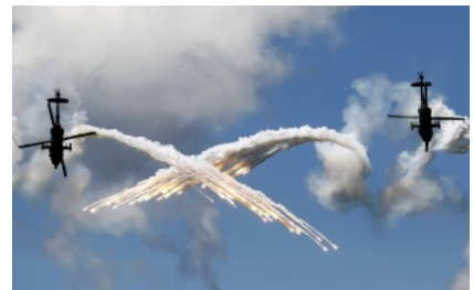
Our top photos from the last 24 hours. Slideshow >